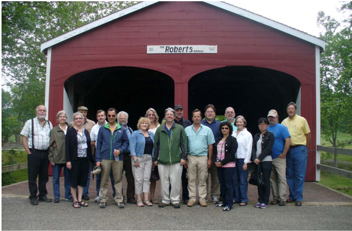
The Preble County Tour had lunch at Roberts Bridge, the only double-barreled and oldest covered bridge in Ohio (1829).