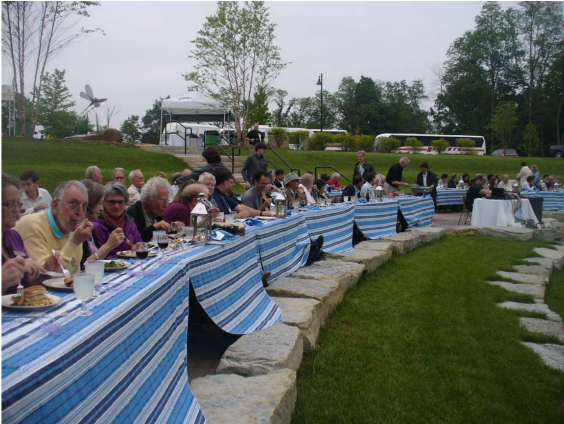
Conference goers received local hospitality at a hog roast hosted by the Preble County Historical Society at their amphitheatre, and enjoyed music by the ensemble "Puzzle of Light."