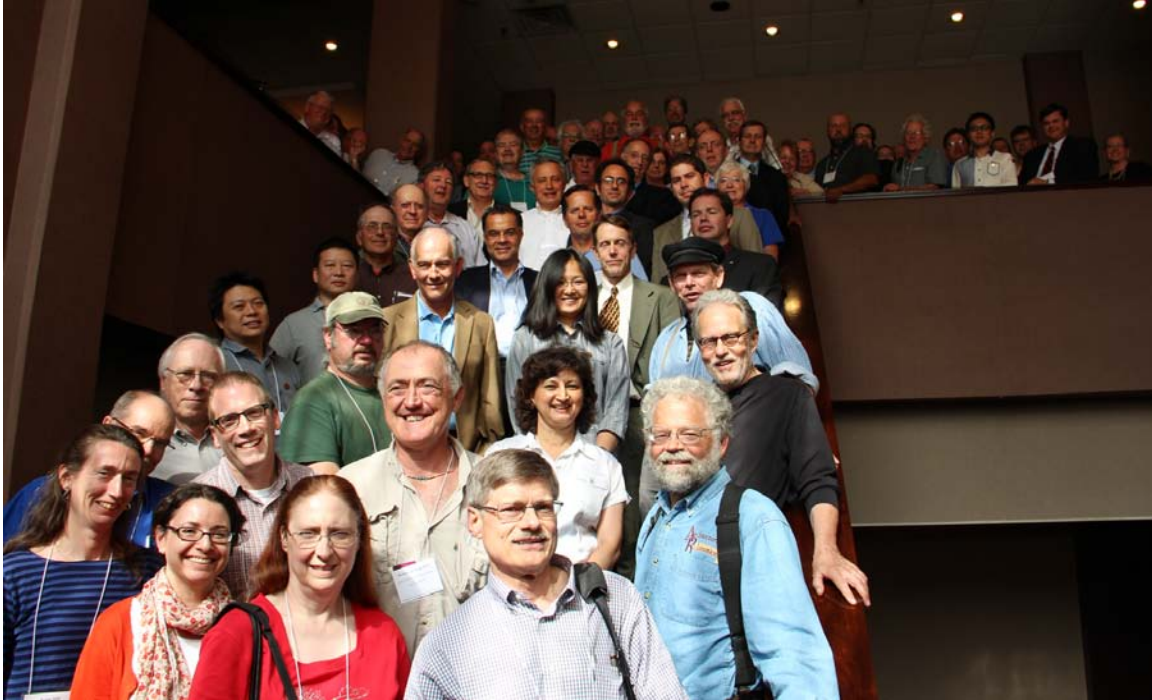
Second National Covered Bridge conference group photo at the Crowne Plaza Dayton.