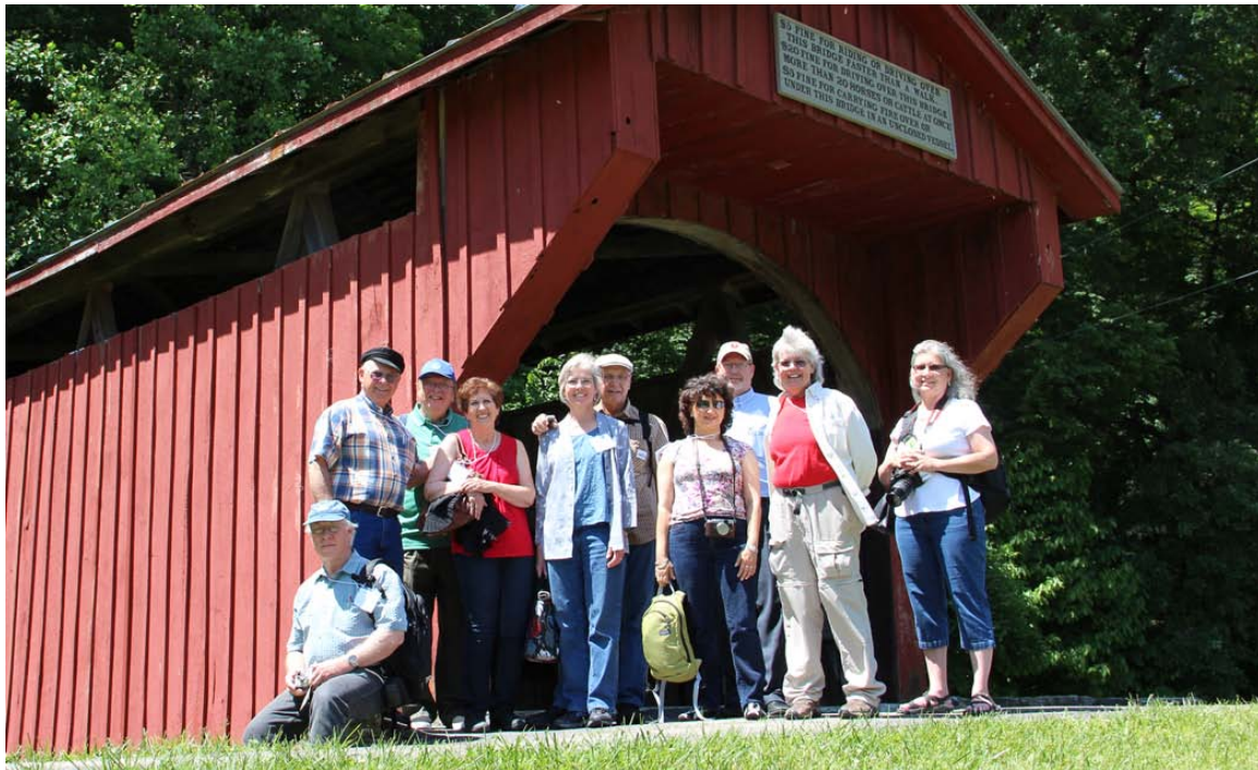
Dayton Aviation Heritage tour group at the Feedwire Road Bridge at Carillon Historical Park.