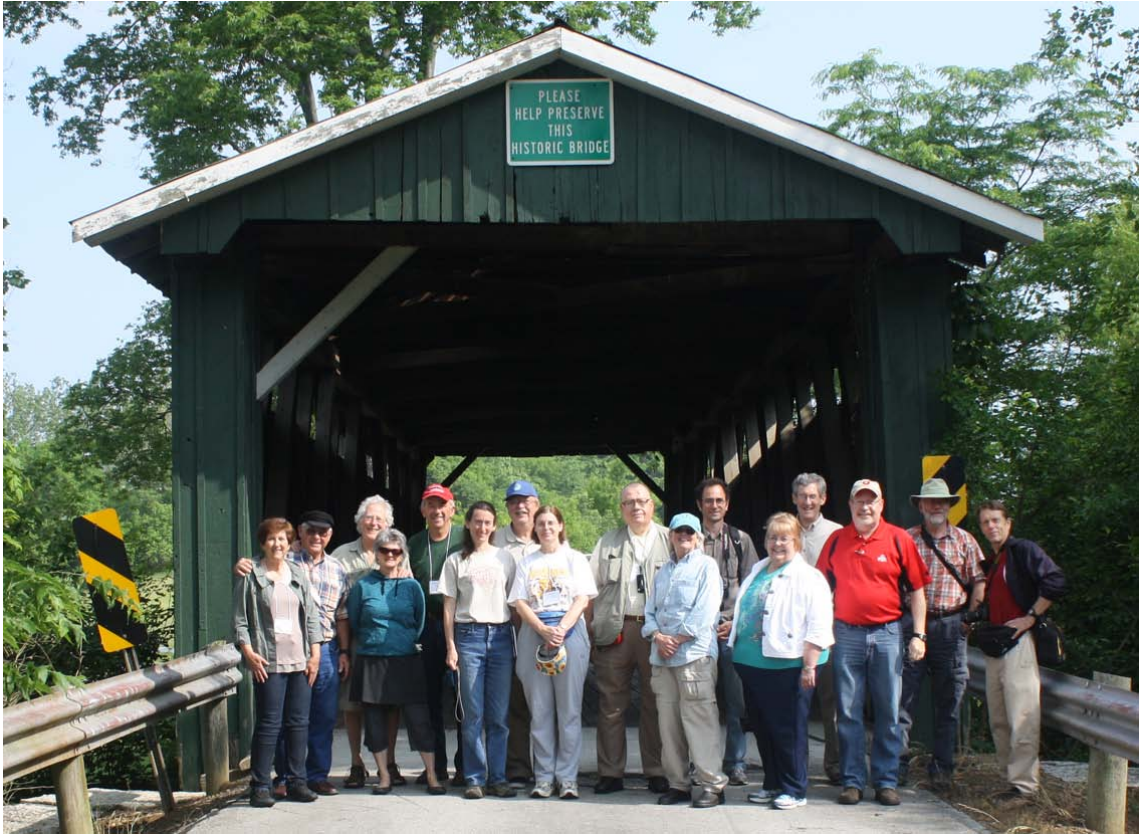
The Greene County tour group photo at the Ballard Road Bridge, an 1883 Howe truss.