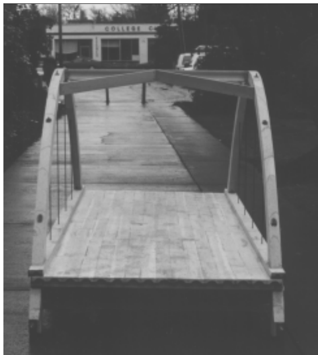
First Place Winner — Oregon State ASCE Student and Forest Products Society Chapters

In the Performance Category , the joint entry from Oregon State University’s ASCE and FPS Chapters captured First Place . This excellent entry also received awards for Best Design, Most Aesthetic Design and Most Innovative Use of New or Nontraditional Materials . It was a great example of what can be achieved when engineers and wood products specialists work together to maximize the engineering capabilities of wood. The bridge’s twin, parabolic, tapered glue-laminated arch stringers were of center vertical grain (CVG) Douglas Fir composition. The deck was longitudinal splined and finger-jointed CVG Sitka Spruce, fluted for one-way action and supported by floor beams of modified manufactured I-joists with carbon tensile reinforcing laminations. High-strength, 1/2-inch steel rods connected the suspended structure to the arches.