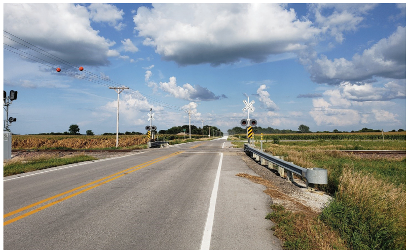
Justin Cyr 2018, CTRE

To mitigate the impacts of crashes involving railroad infrastructure, barriers such as guardrails or crash cushions are sometimes installed at or near at-grade crossings to protect motorists or to shield the infrastructure.